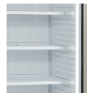
Vertical internal light